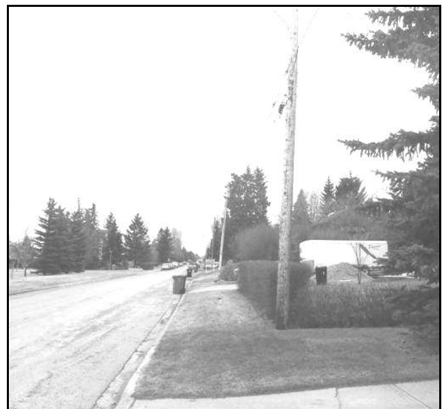
Above: present-day View of 33rd Avenue near Wood’s Home Entrance