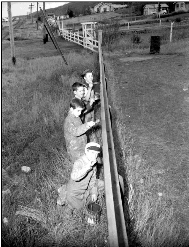
Left: Painting the fence at Wood’s Christian Home, Hillside Avenue (now 33rd Avnue), 1940s